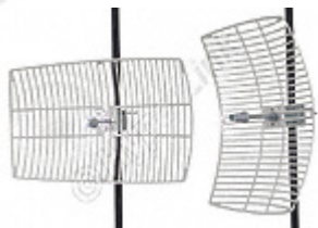
Vertical or Horizontal Polarization

The antennas' construction features a rustproof cast aluminum reflector grid for superior strength and lightweight. The 2-piece reflector grid is simple to assemble and significantly reduces shipping costs. The grid surface is UV powder coated for durability and aesthetics. The open-frame grid design minimizes wind loading. This antenna is supplied with a 60-degree tilt and swivel mast mount kit. This allows installation at various degrees of incline for easy alignment. They can be adjusted up or down from 0° to 60°.