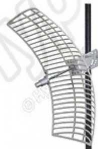
Tilt & Swivel Mast Mount