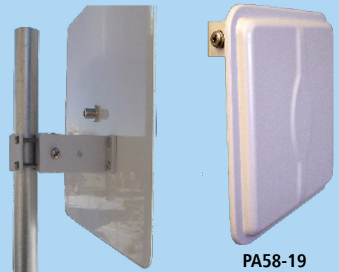
PA58-19 Surface Mount