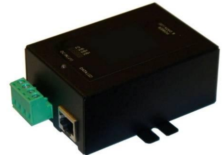
TP-DCDC-1248M (Metal Enclosure)