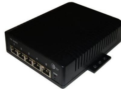
TP-SW5G-D (802.3af/at) TP-SW5G-NC TP-SW5G-24 (802.3af/at)