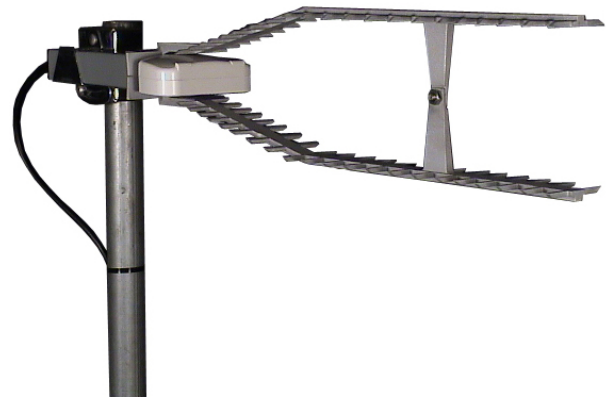
*16dBi Directional Vagi Antenna – Horizontal