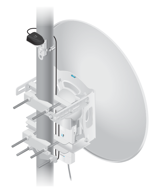
AF-5XHD Pole-Mount Installation