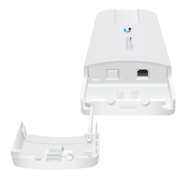
AF-5XHD with Optional IP67 Kit Installed

* Available with a future firmware upgrade.