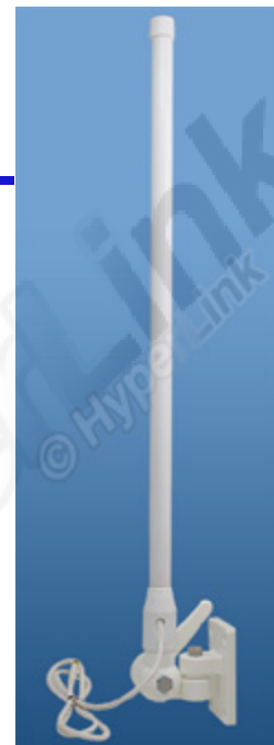
Shown on Optional Marine Antenna Mount